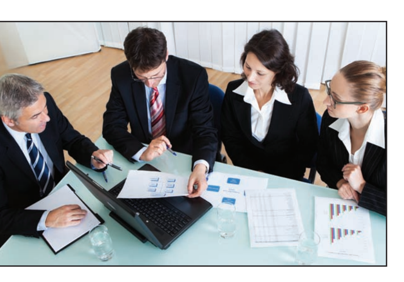
KYOCERA'S ACCUSENDER FAX ENABLES USERS TO EASILY SEND SCANNED DOCUMENTS OF ANY SIZE VIA SECURE FAX FROM SELECT KYOCERA MFPS

Despite the increased use of digital technology, vertical markets such as healthcare, manufacturing and financial services are still heavily dependent upon fax technology as part of their processes. While fax is a necessary requirement, standalone equipment and supplies are costly, and the transmission process is time-consuming. Moving from manual faxing to an e-mail fax solution represents one of the most cost-effective, productivity-enhancing improvements available to organizations in fax-intensive industries.