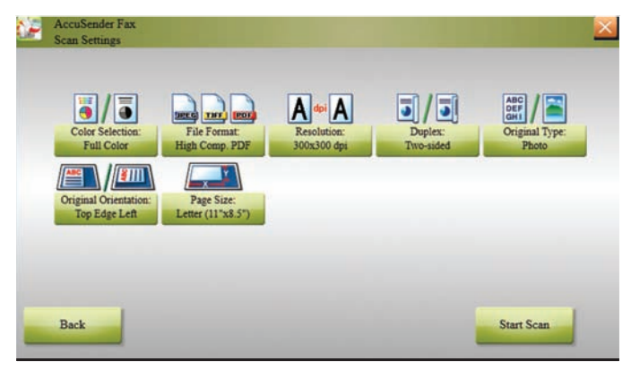
AccuSender Fax offers many user defined scan options

KYOCERA's HyPAS (Hybrid Platform for Advanced Solutions) is a powerful and scalable software solution platform. Through direct enhancement of the MFP's core capabilities, to the integration with widely accepted software applications, HyPAS will enhance your specific document imaging needs, resulting in improved information sharing, resource optimization and document workflows.