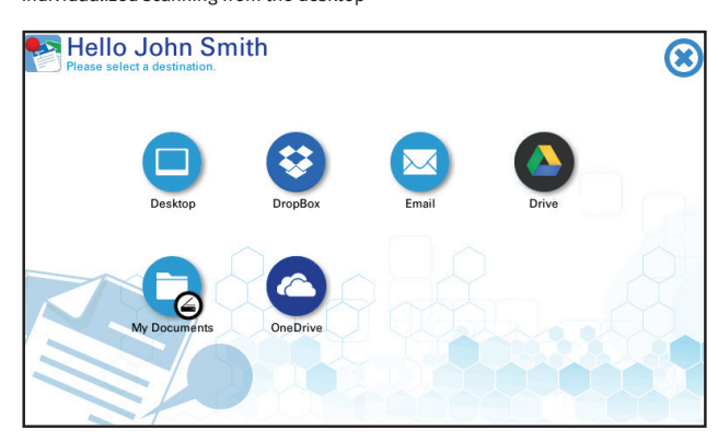
Easy access to PinPoint Scan 3 destinations from the MFP control panel